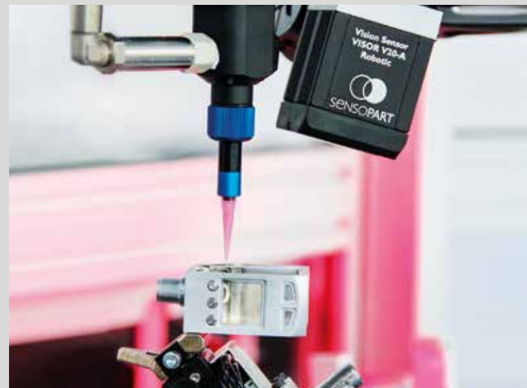
The VISOR® Robotic determines the exact position of the sensor housing. Offset data is used to correct the robot's trajectory.

What happens after components have been reliably collected by the gripper? The VISOR® Robotic also supplies important information for the next work steps, and demonstrates its skills in robot-controlled applications, such as the placing of screws, the mounting of clips or the application of glue. The detection of component positions is carried out effortlessly; this allows the correction of any offset and increases the quality of production. Knowledge of the exact position of a component ensures, for example, the precise insertion of a windscreen. Mechanical effort is reduced, and the production line becomes even more flexible. The VISOR® Robotic concept enables direct communication between the VISOR® and the robot, an additional instance is no longer necessary for many applications.