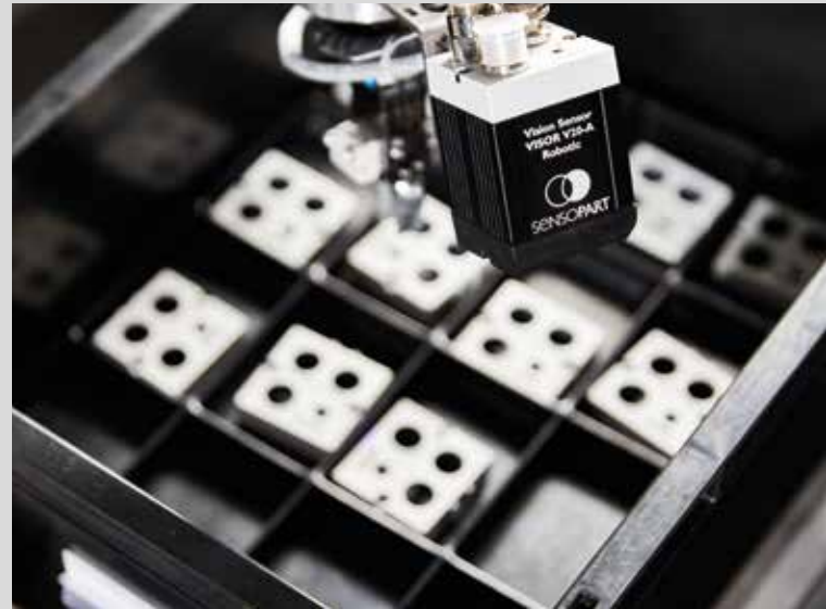
The VISOR® Robotic detects the component's position in a universal tray. It can then be reliably removed. Up to 255 configurations enable utmost production flexibility.

Feeding systems in a production line are becoming increasingly versatile – in addition to universal trays, components can be supplied with utmost flexibility using hopper feeders. Thanks to the VISOR® Robotic, components can be reliably located and gripped with both feed options. When loose components are supplied, the sensor not only checks their position but also inspects the free space around the gripper. The VISOR® determines both sets of information and sends them to the robot controller via one of the integrated and standardised process interfaces. The process is managed on the basis of this information – the object is gripped or the feeder is triggered. The application can also be flexibly adapted to individual goods carriers without the need for a costly centring device. The VISOR® detects the position and the fill level of the tray and transmits this information to the robot. If the camera is mounted in a stationary manner, this is cycle time-neutral.